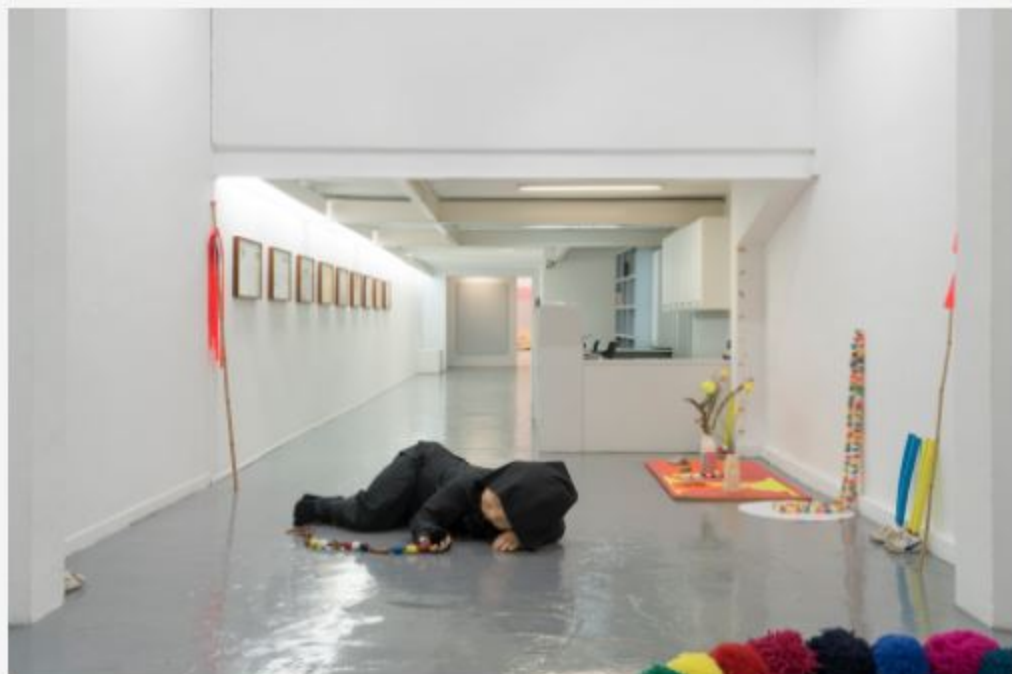
Soft Power | Courtesy of ADN Gallery

📍 ADN Gallery, Carrer d'Enric Granados, 49, Barcelona, Spain