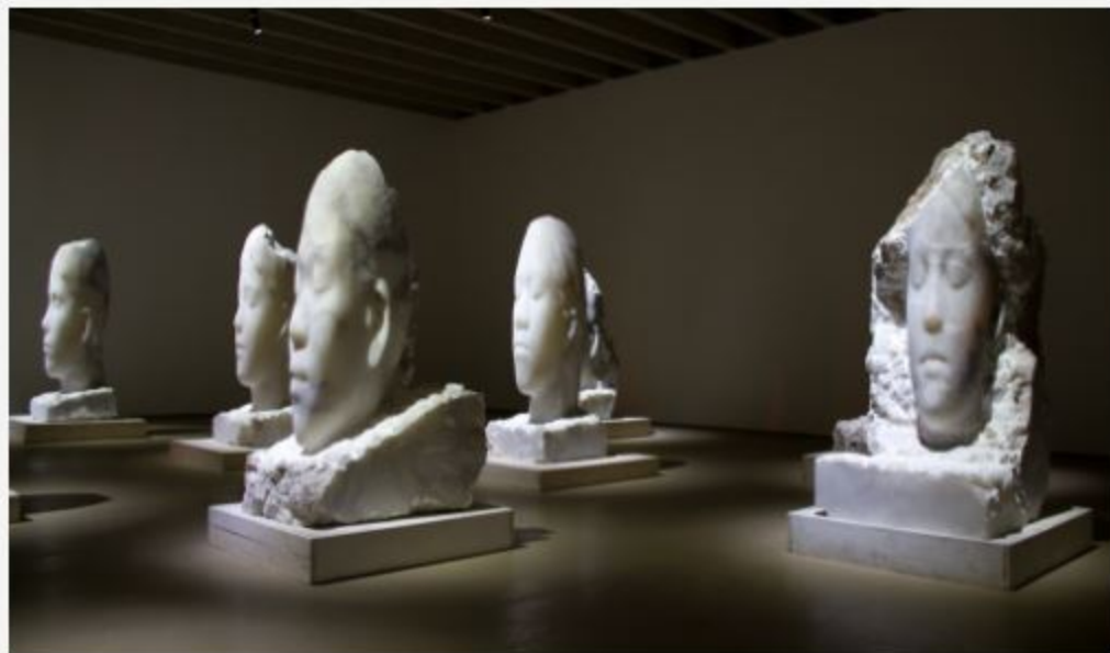
Jaume Plensa's alabaster heads