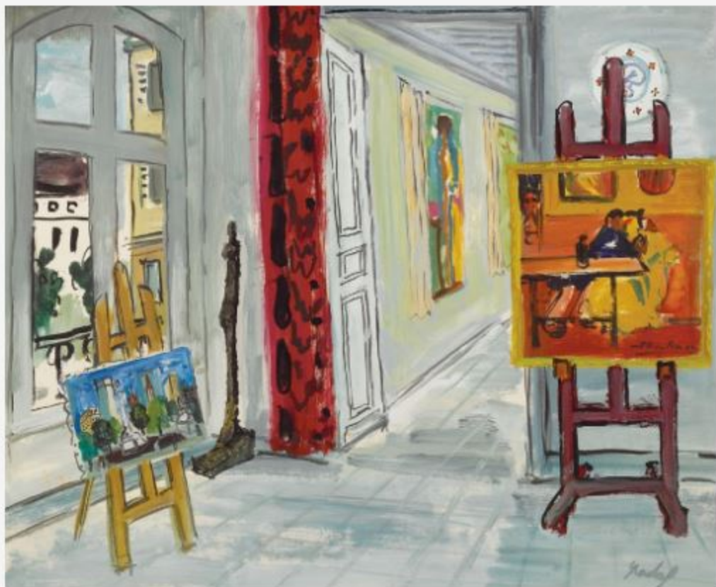
Painting of the Sala Parés by Carlos Nadal

Gallery Trama, Carrer de Petritxol, 5, Barcelona, Spain