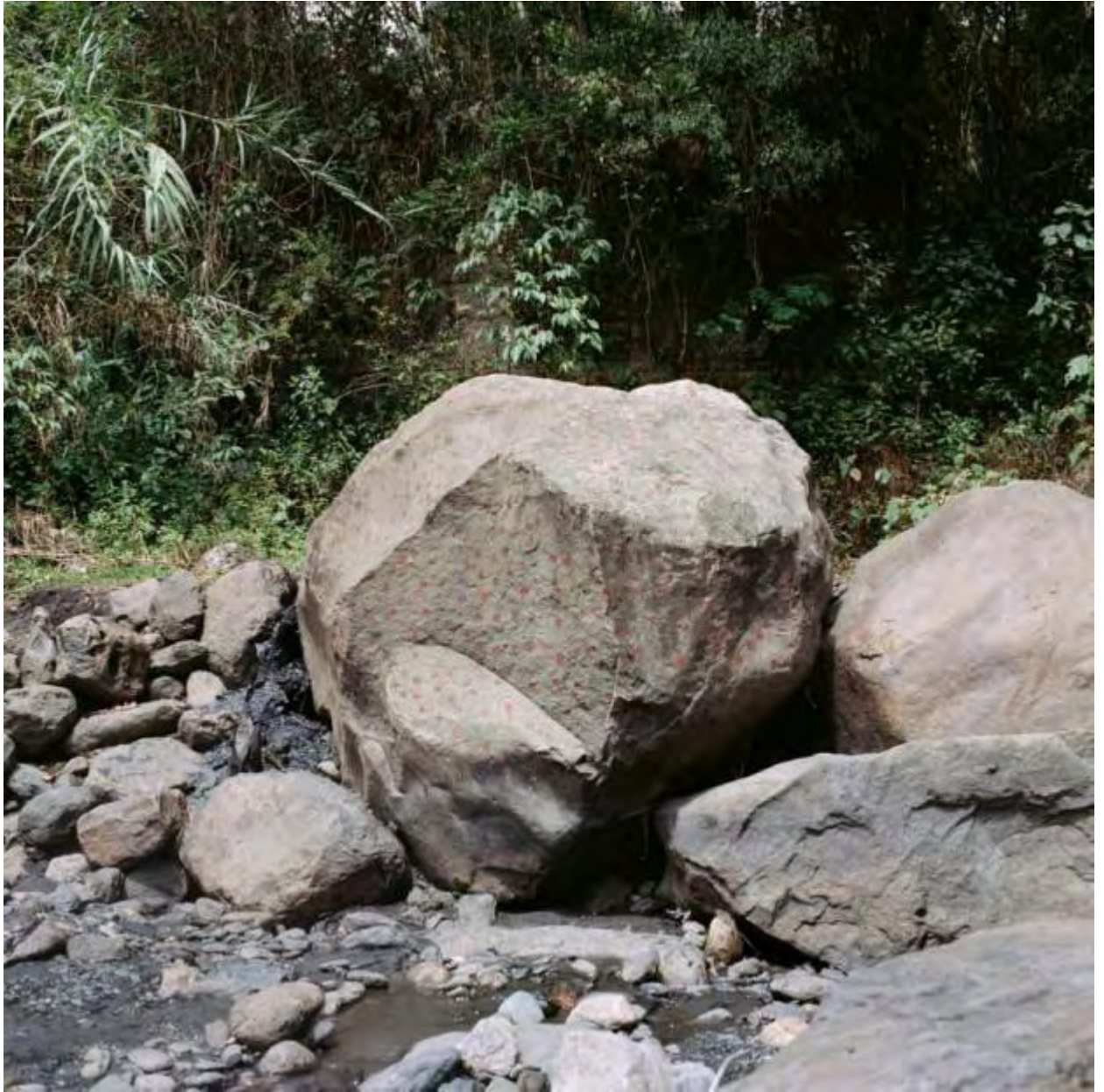
Dándole peso a los besos Photograph, 160 x 160 cm 2012